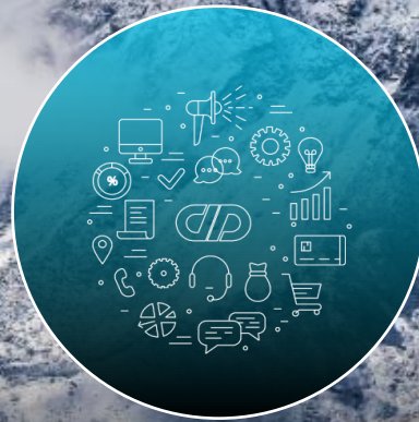
MARKETING AND PROMOTION