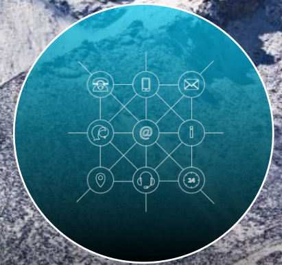
GET IN TOUCH