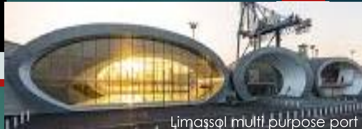
Limassol multi purpose port

Corporations & individuals relocating to Cyprus receive a safe landing and complete peace of mind since we take care of all legal, immigration, and taxation issues.